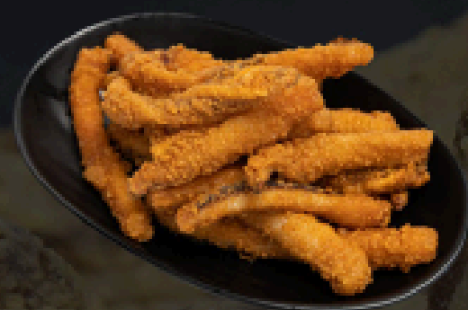
Street Calamari $ 8