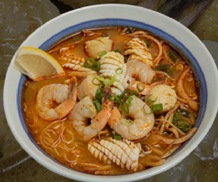
Seafood Tom Yum $ 19.5