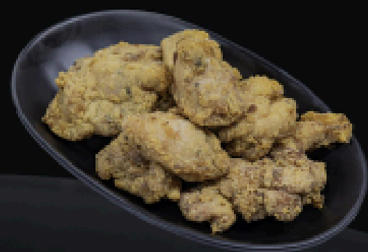
Chicken Karrage Small $ 9.5 Large $ 17.9