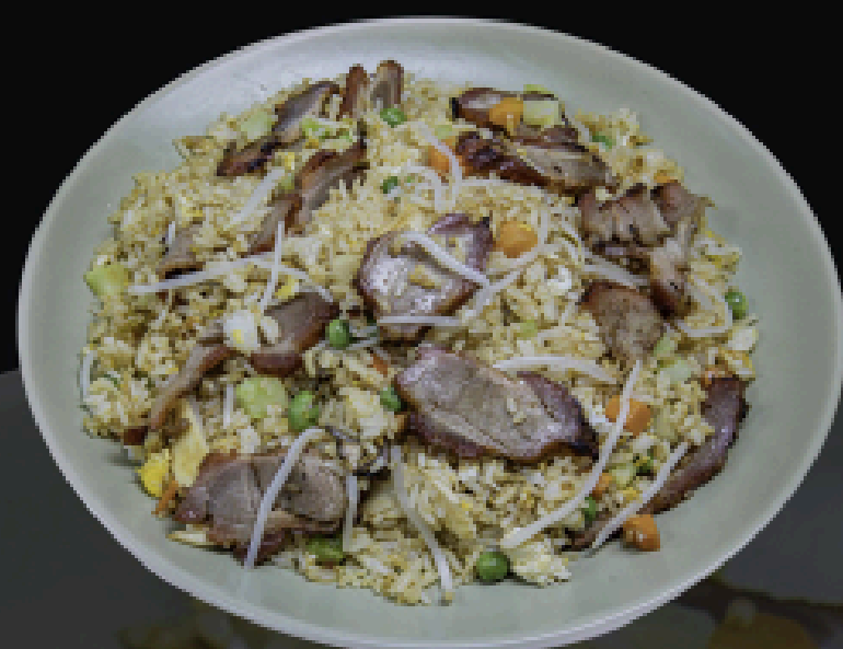
BBQ Pork Fried Rice $ 15.9