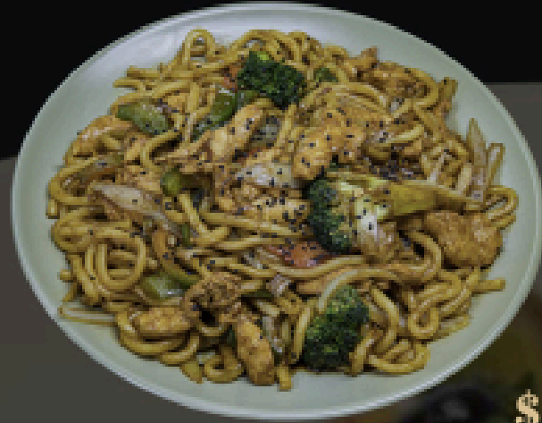
$ 16.9 Teriyaki Chicken Udon