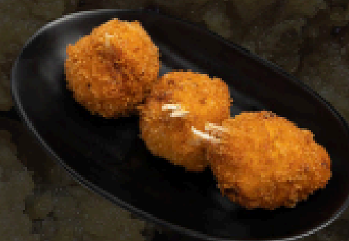
Crab Claws $ 8