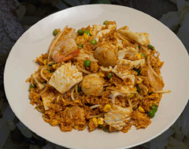
Seafood Nasi Goreng Fried Rice $ 19.5