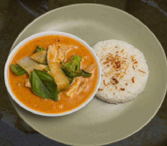
Thai Red Curry Chicken With Steam Rice $ 16.5