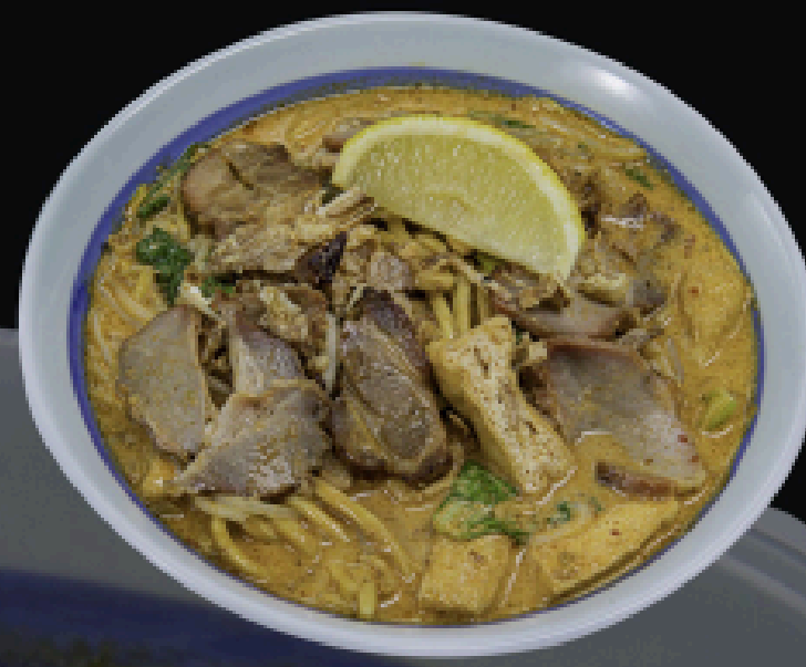
BBQ Pork Laksa $ 17.9