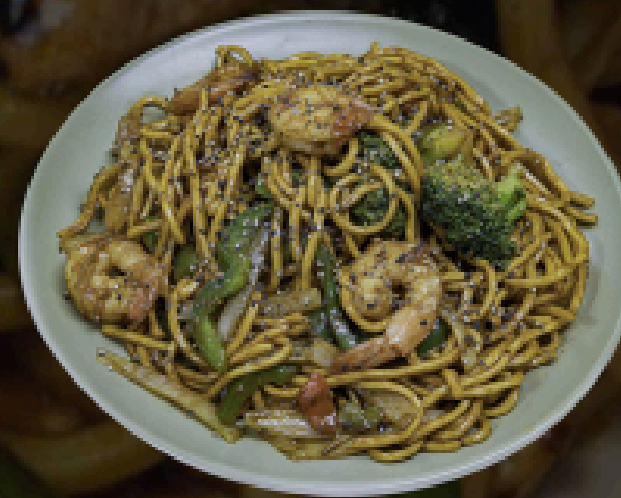
$ 19.5 Black Pepper King Prawns Chow Mein