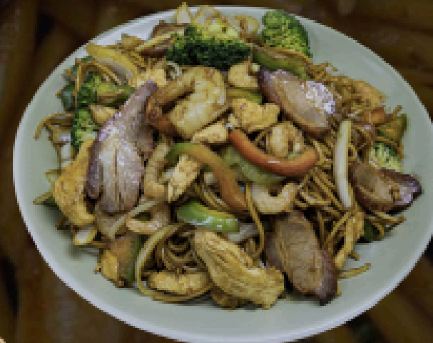
$ 18.9 Combination Chow Mein