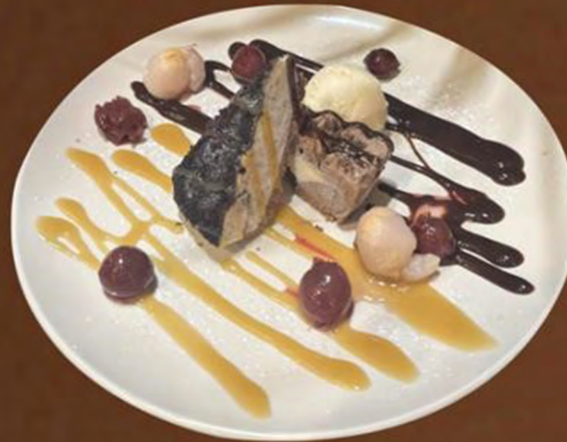
Chocolate Cookies Cake with Ice Cream $ 8.5