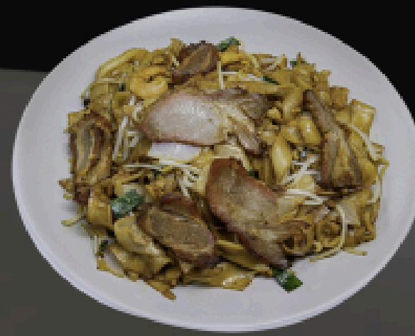
$ 16.9 Chow Kway Teow (BBQ Pork & Prawns)