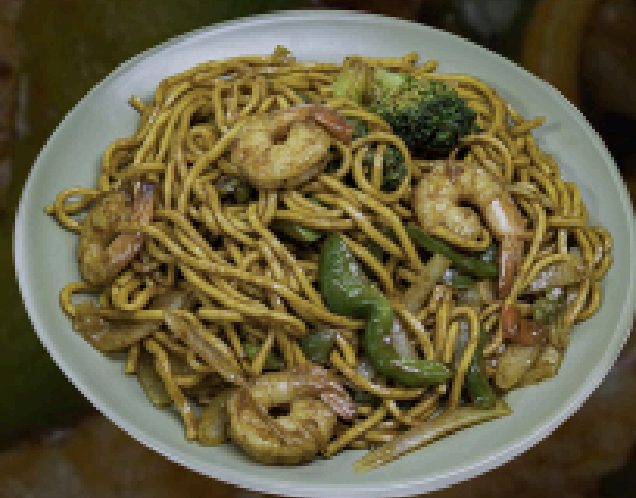
$ 19.5 Garlic King Prawns Chow Mein