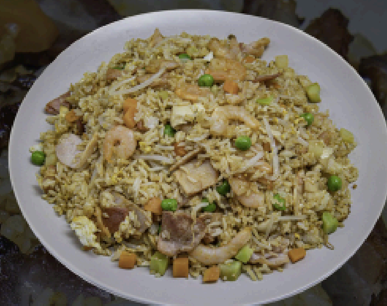
Master Fried Rice (Bacon & Prawns) $ 16.5