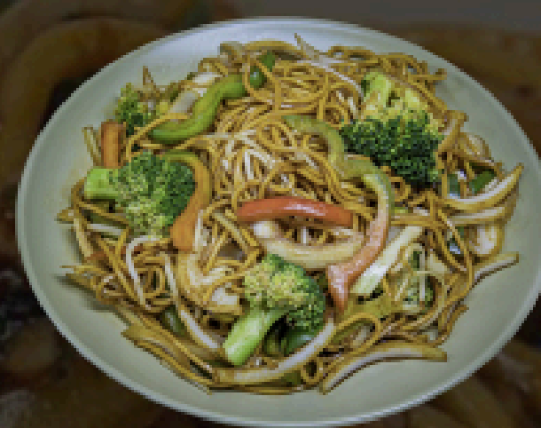
$ 16.9 Vegetarian Chow Mein ✓