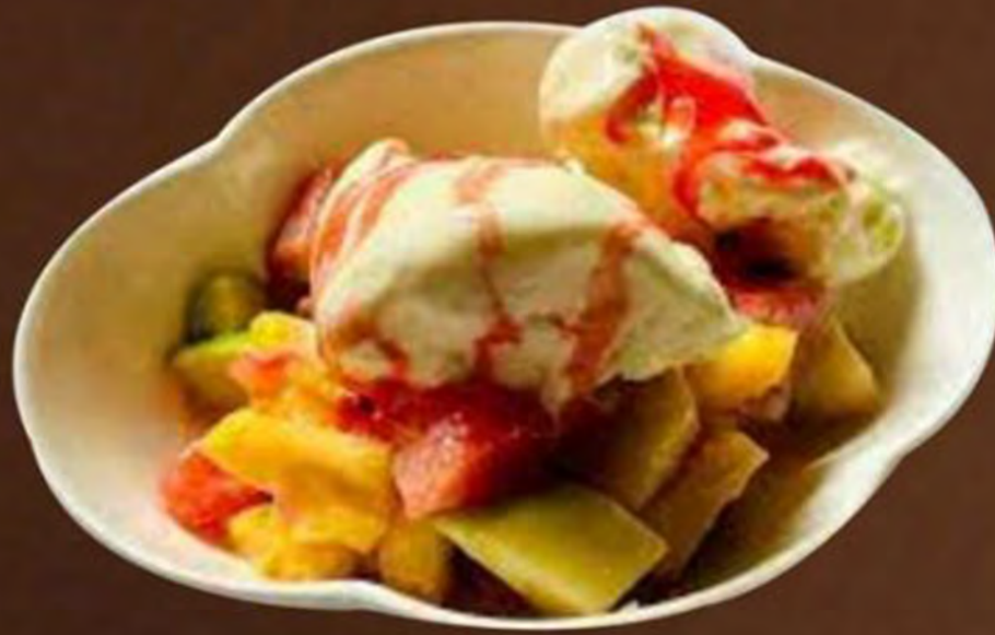
Fruit Salad Ice Cream $ 9.5