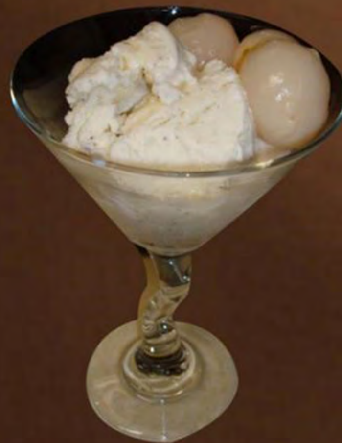
Lychee Ice Cream $ 7.5