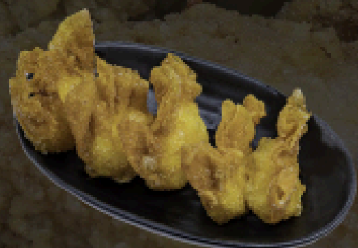
Fried Wonton $ 8