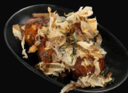
Takoyaki $ 7.5