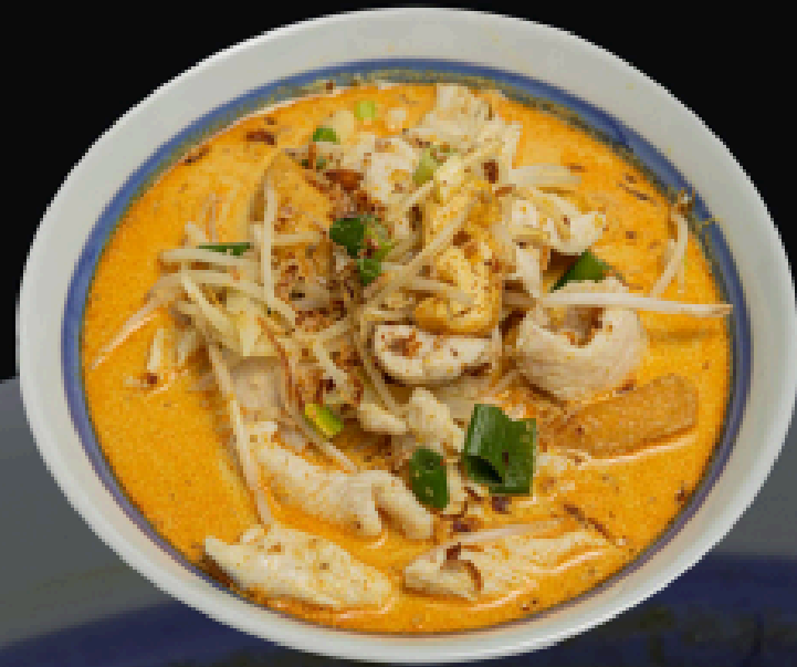
Chicken Laksa $ 17.9