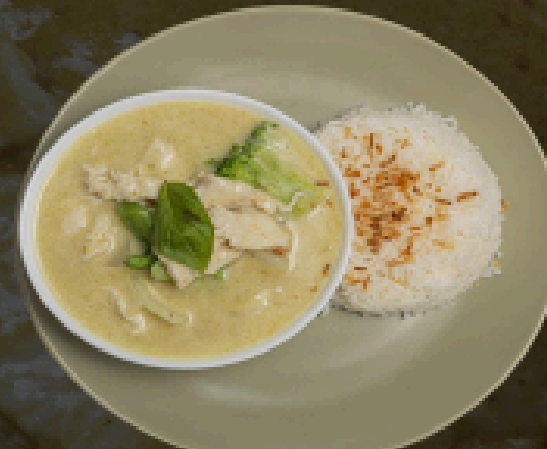
Thai Green Curry Chicken With Steam Rice $ 16.5