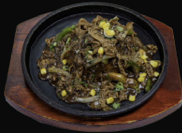
Sizzling Black Pepper Slice Beef With Steam Rice $ 16.5