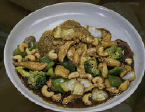
Chicken Cashew Nuts With Steam Rice $ 16.5