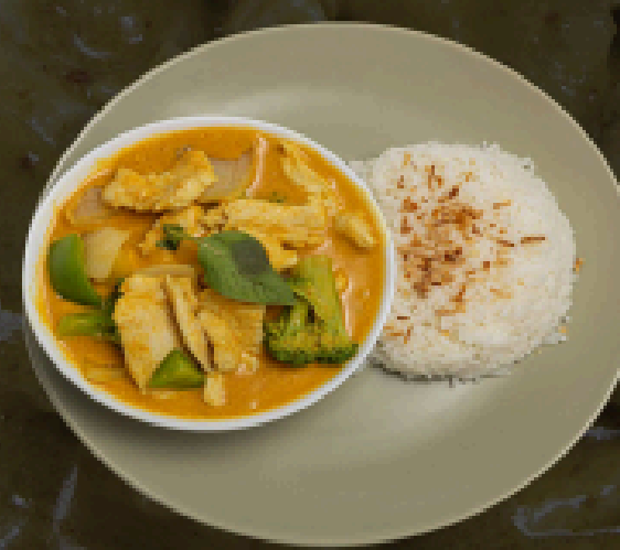
Malaya Curry Chicken With Steam Rice $ 16.5