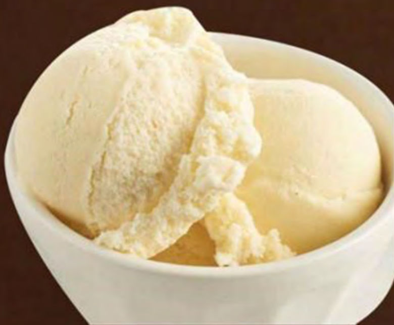
Plain Vanilla Ice Cream $ 5.5