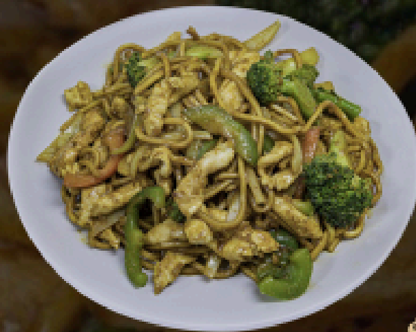
$ 16.9 Satay Chicken Chow Mein