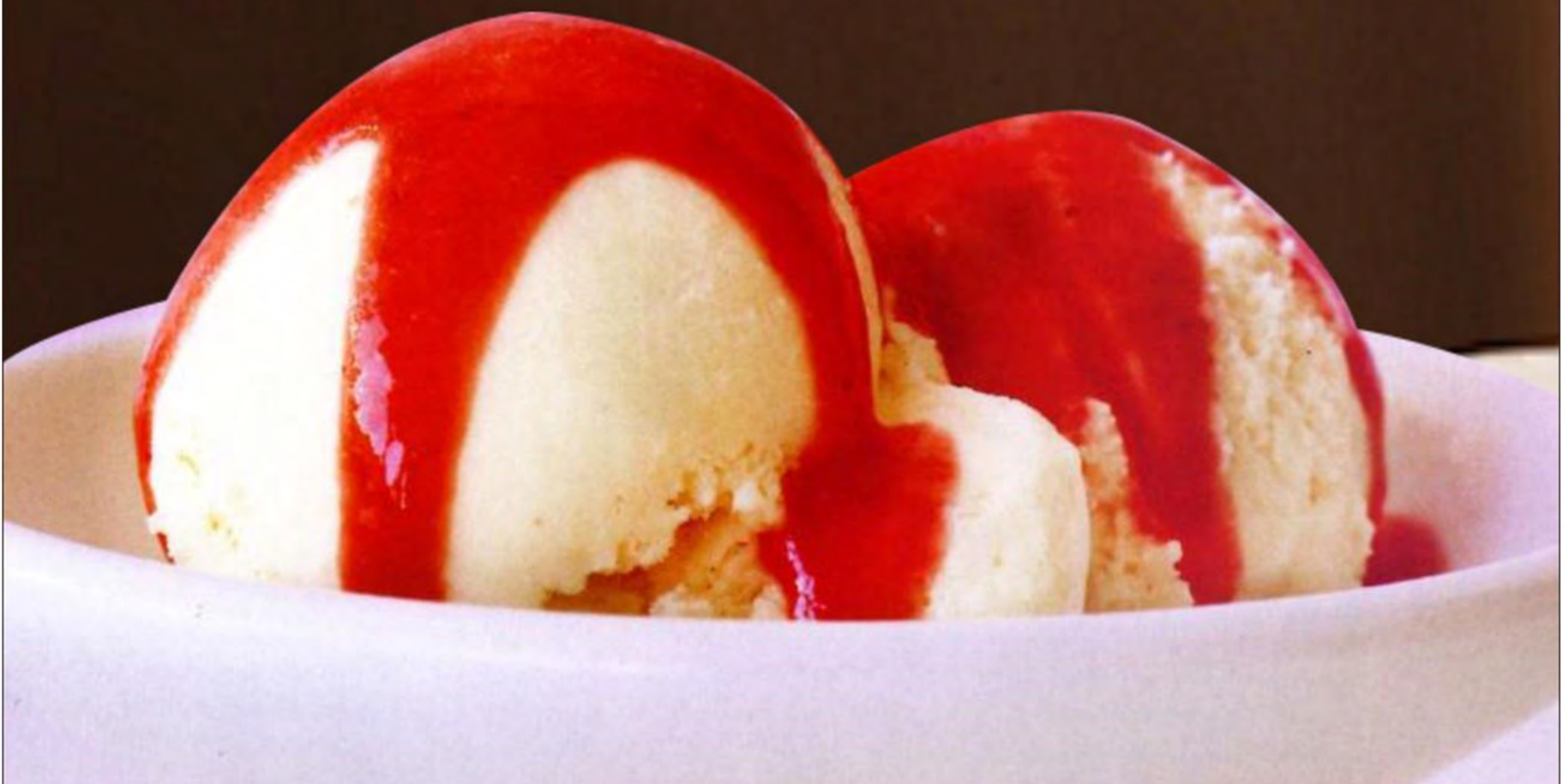
Vanilla Ice Cream with Topping $ 6.5