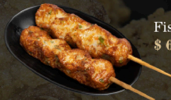
Fish Cake $ 6.5