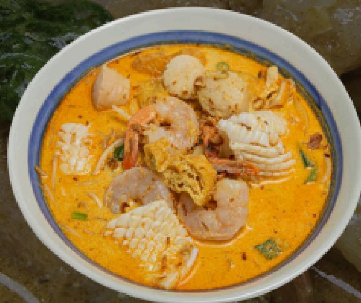
Seafood Laksa $ 19.5