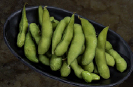
Edamame ✓ (shell soy bean) $ 6.5