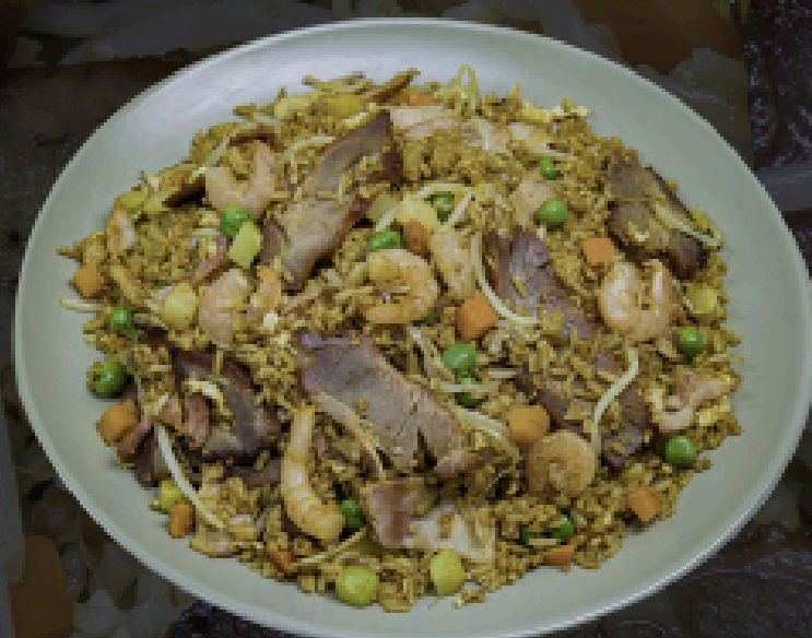
Nasi Goreng Fried Rice (BBQ Pork & Prawn) $ 16.9