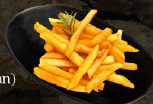
Crispy Fried Small $ 6 Large $ 11