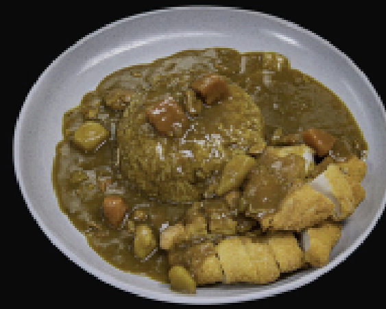
Japanese Curry Chicken With Steam Rice $ 16.5