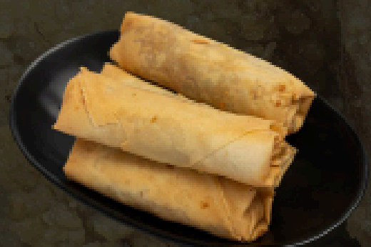
Spring Rolls ✓ $ 8.5