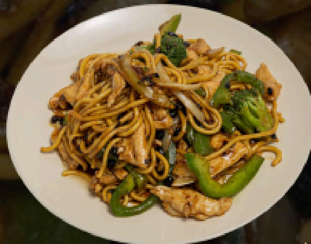
$ 16.9 Black Bean Chicken Chow Mein