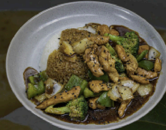
Teriyaki Chicken With Steam Rice $ 16.5