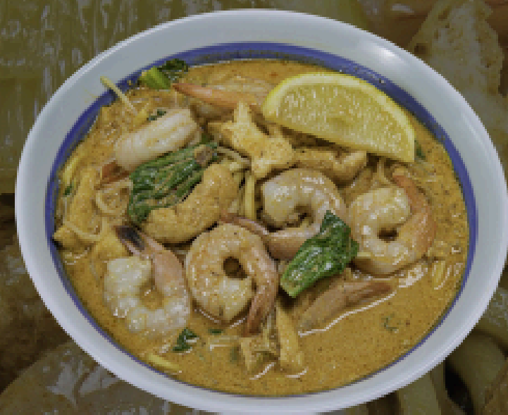
King Prawns Laksa $ 19.5