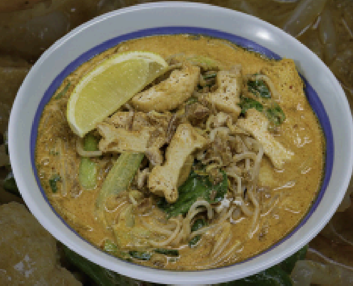
Vegetarian Laksa ✓ $ 17.9