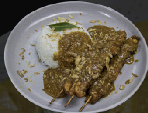
Satay Chicken Sticks With Steam Rice $ 16.5