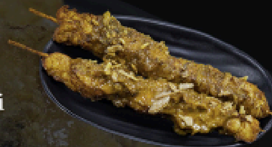
Satay Chicken Sticks $ 7